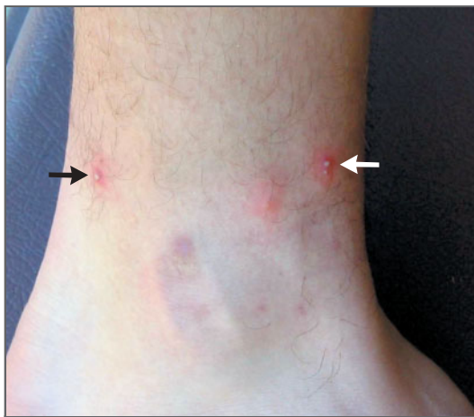
Figure 2. Stings from a Fire Ant on an Ankle, Showing the Pseudopustule.

The clustering of the stings (white arrow) contrasts with the single sting (black arrow) in the photograph, which was taken 24 hours after the event. This pattern is typical of fire-ant stings, as one ant will often inflict multiple stings in a semicircular arc if given time to do so. Also, the pseudopustule is typical of fire-ant stings; it is not a pustule. The stings occurred just above the level of the ankle sock the patient was wearing on the day of the event.