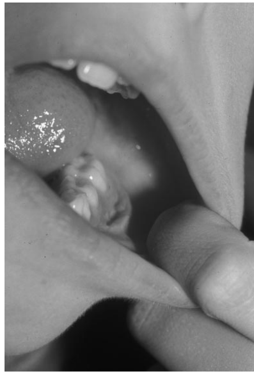
Fig 3. Patient 2: linear oral ulceration and hyperplastic ridges in the inferior gingival sulcus.

In our series of children with silent IBD, mucocutaneous lesions appeared before gastrointestinal signs as the manifestation of Crohn's disease (8 of 9) or ulcerative colitis (1 of 9). (Table 1 provides a summary of these cases.) Of the 9 patients, 8 were male, and the mean age was 8 years. Although patients with IBD tend not to be overweight, 2 of our patients were obese (patients 3 and 8). Six children presented with oral manifestations, 1 had genital lesions, and 2 had pyoderma gangrenosum. All patients were asked about gastrointestinal symptoms, fever, weight loss, and joint pain at presentation and denied any such symptoms. The majority of our patients (7 of 9) had perianal lesions at presentation; however, several of the perianal lesions were not discovered on initial evaluation but only became apparent during subsequent examinations. The time to diagnosis of IBD after development of the mucocutaneous findings ranged from 1 month to 42 months. In general, patients with oral and perianal lesions experienced a longer time until diagnosis compared with patients with lesions that presented elsewhere. One patient (patient 8) was diagnosed with Crohn's disease on repeat endoscopy after the initial endoscopy that was performed ~1.5 years