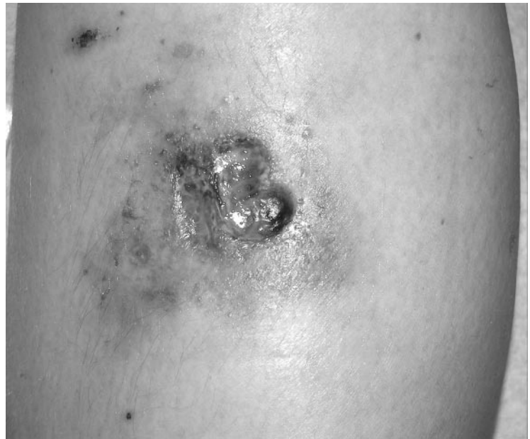
Fig 4. Patient 3: 2 × 2-cm ulcer with indurated violaceous borders on the right lower extremity.

prior was normal. In all patients followed after instituting therapy, the mucocutaneous lesions responded to therapy for their IBD.