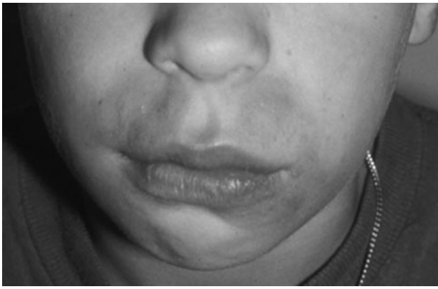
Fig 2. Patient 1: upper- and lower-lip swelling 3 years later.

gastritis, terminal ileum granulomas, and granulomatous colitis, confirming the diagnosis of Crohn's disease.